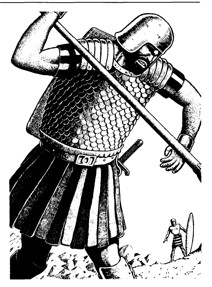
Goliath's shield-bearer stared in disbelief as the stone from David's sling struck the giant between the eyes, killing him instantly!

Do you think David was afraid? Let's look and see. Turn to I Samuel 17:45-47 and fill in the blanks. "Thou _____ to me with a _____ and with a _____, and with a _____: but I come to _____ in the _____ of the ____ of hosts, the _____ of the ____ of Israel, whom _____ hast _____. "This ____ will the ____ thee into ____ hand; and ___ will _____ thee, and take _____ ____ from thee; and ____ will give the _____ of the host of the _____ this day unto the fowls of the _____, and to the _____ beasts of the _____; that all the ____ may know there is a _____ in _____. "And all this assembly shall that the _____